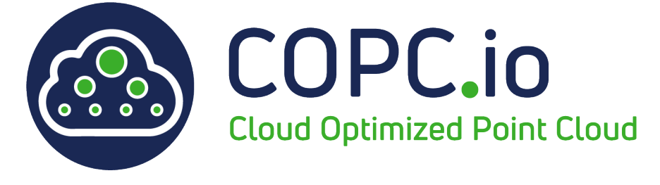
Figure 1: COPC Logo